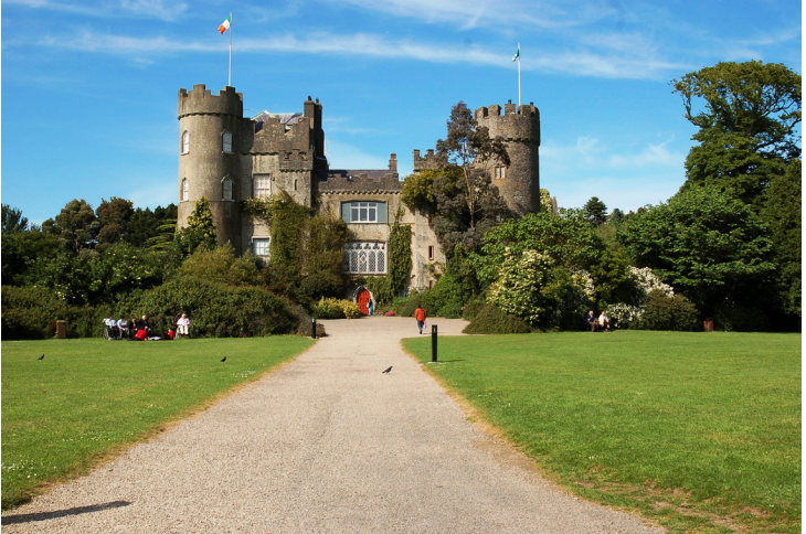
DAY 10 July 15th: Dublin / Journey Home Departures from Dublin. ( Transfers to the Dublin Airport are included. )

On this day, we will travel to the stunning County Wicklow, known as the "Garden of Ireland." Here, we will visit Powerscourt Estate, Glendalough, and Blessington Lake. In the evening, we will have a farewell dinner in one of Dublin's fine restaurants. Meals: B, L, D | The Westbury Hotel