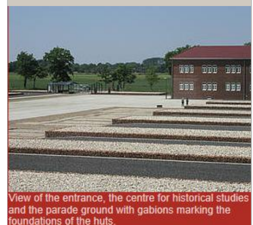
View of the entrance, the centre for historical studies and the parade ground with gabions marking the foundations of the huts.